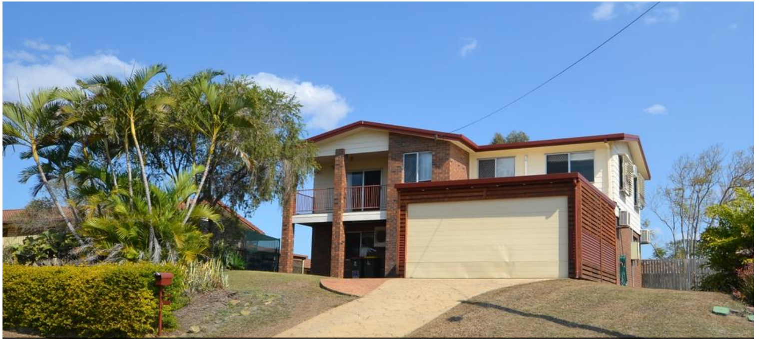
19 Reservoir Street, Gracemere